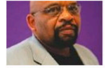
We're sticking with Rep Charlie Rangel